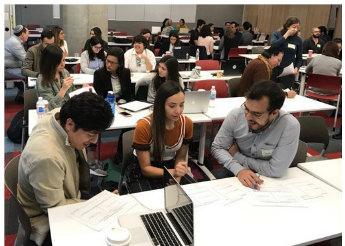
Participants discuss the ecosystem's purpose in small groups

The workshop brought together 47 actors representing 34 organizations in the ecosystem, which reflected a diversity of both actor types and roles. The actor types represented included universities and research centers; co-working spaces, incubators and accelerators; public and private innovation centers; representatives of networks and associations of entrepreneurs and innovators; chambers of commerce; representatives of the state and municipal government; and one representative of the press (a leading magazine for the tech industry). The event was hosted at Centraal Bosch, an open innovation center, co-working, and meeting space administered by a German technology company.